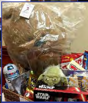
STAR WARS APRIL 2016 SILENT AUCTION BASKET